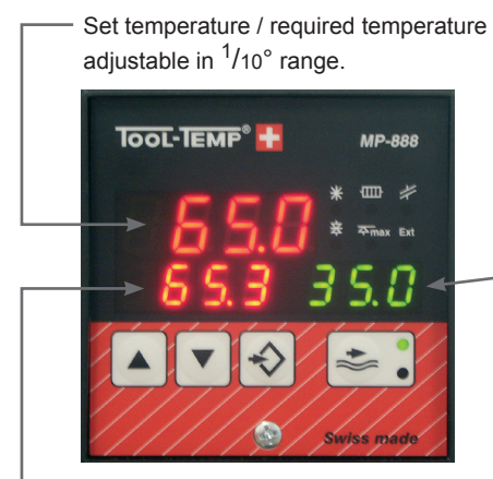
Actual temperature / effective temperature displayed in ^{1}/_{10}^{\circ} range.

The electronic controller MP-888 can be operated to read °C or °F. The analog interfaces 0-5 V, 0-10 V and 4-20 mA are standard included in the controller - without additional costs .